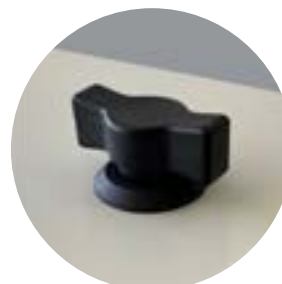
Wing Knob (non-locking)