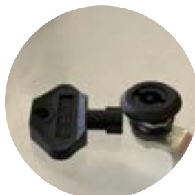
Double Bit Lock